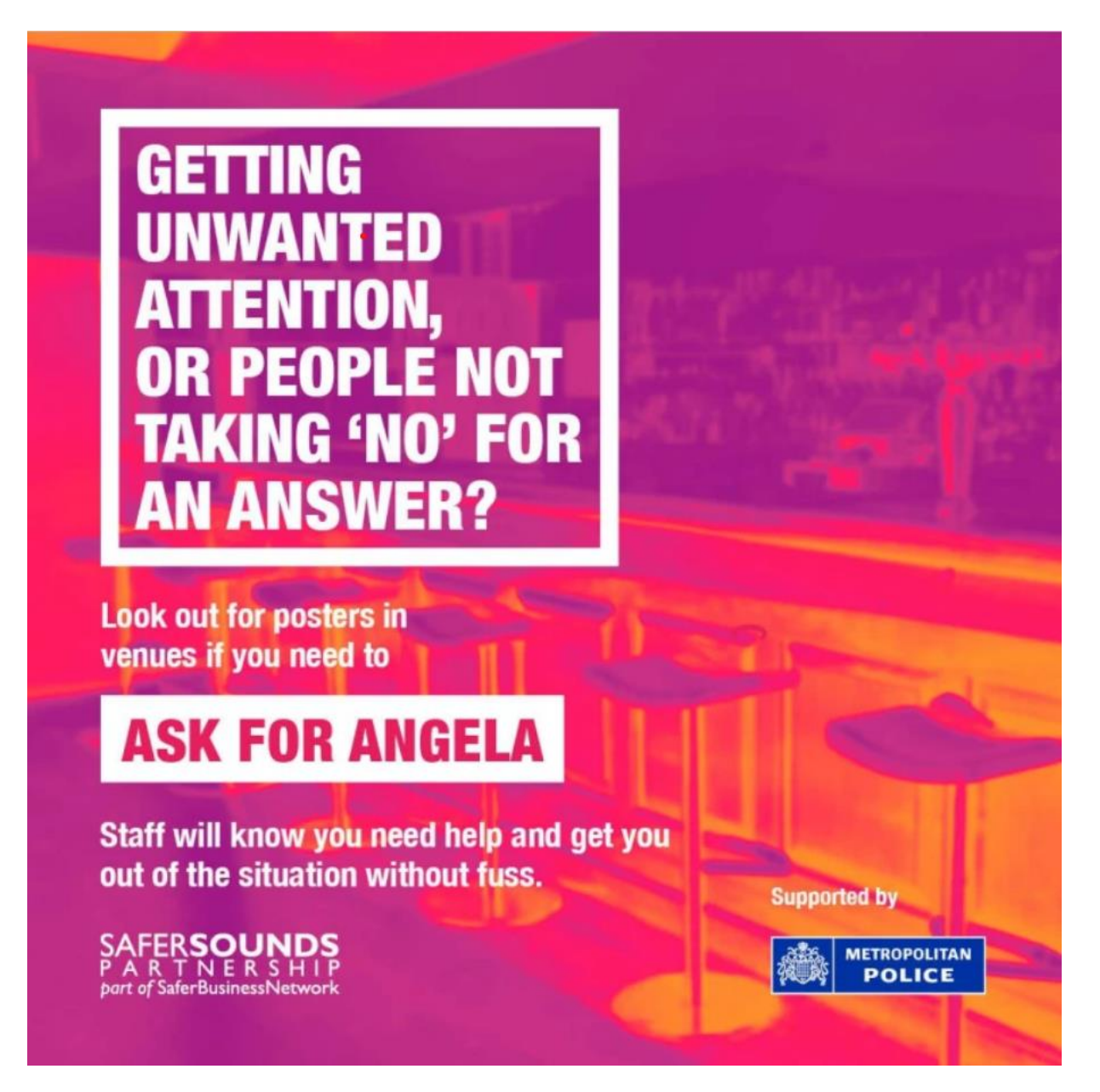
Fig 1. Example of an 'Ask for Angela' poster.